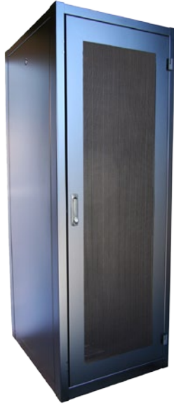
Series 24 Universal Server Cabinet – Kitted

R. F. Mote Series 24 Kitted Cabinets include: 2 lockable doors, 2 side panels, mounting rails, levelling feet, top cover plates, and hardware package. Ganging version ships without side panels.