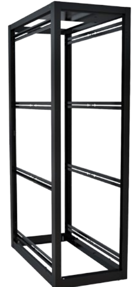
24" Wide cabinet frame