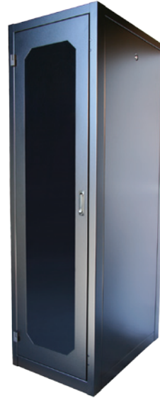
Series 24 Universal Patching Cabinet – Kitted