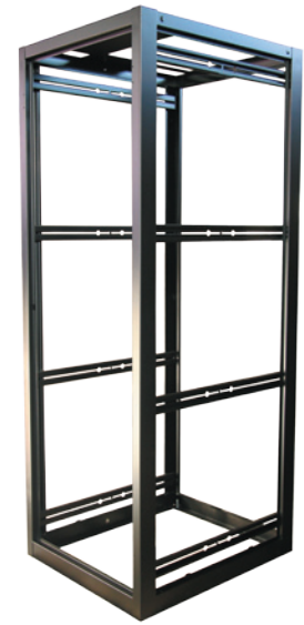
24" Wide cabinet frame