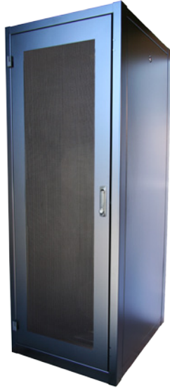
Series 24 Universal Server Cabinet – Kitted

R. F. Mote Series 24 Kitted Cabinets include: 2 lockable doors, 2 side panels, mounting rails, levelling feet, top cover plates, and hardware package. Ganging version ships without side panels.