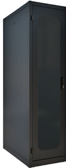
Series 24 Universal Patching Cabinet – Kitted