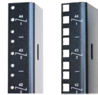
Mounting Rails / Angles