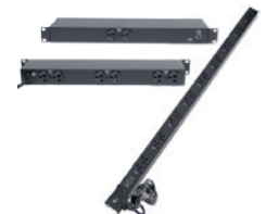
Power Bars – Horizontal & Vertical