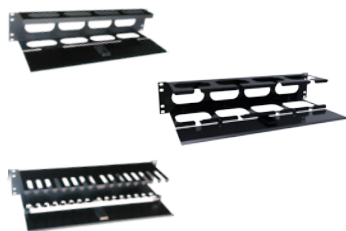
Horizontal Cable Management