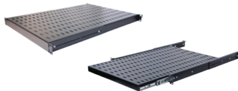
Adj. Mount Depth - Fixed Position