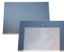
Cabinet Side Panels