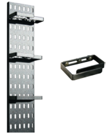
High Density Vertical Cable Trough