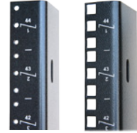
Mounting Rails / Angles