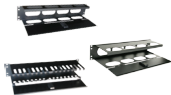
Horizontal Cable Management