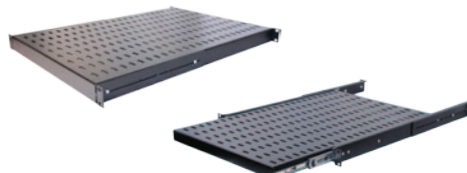
Adj. Mount Depth - Fixed Position