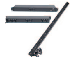
Power Bars – Horizontal & Vertical