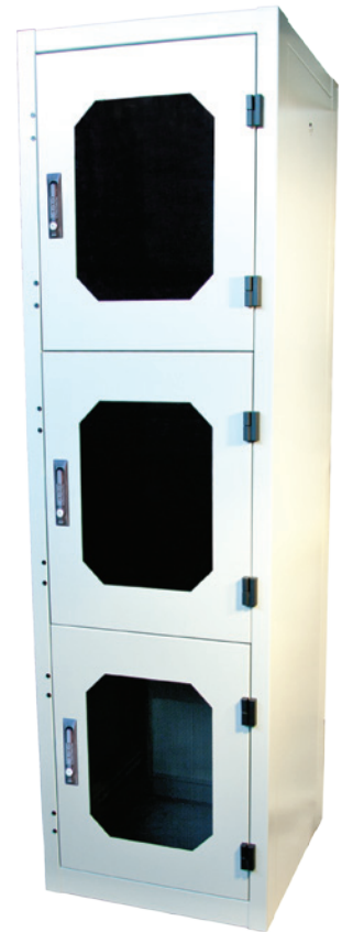
3-Compartment CoLocation Cabinet